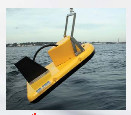
II SB-216S TOWFISH