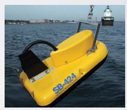
III SB-424 TOWFISH

For more information please visit EdgeTech.com